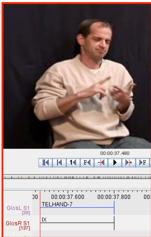
Figure 3. Simultaneous constructions involving numeral buoys

In the online NGT lexicon 4 these variants are not all listed as instances of a shared type; this is one of the reasons why it is hard to use an existing, fixed, lexicon for annotating a sign language corpus. The variation in the combinations of manual and non-manual forms can be used to further enhance existing lexicons.